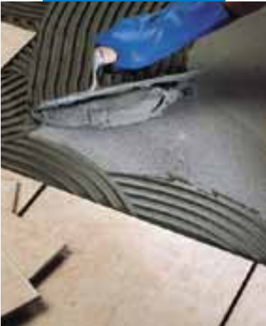
Installation of single-fired tile on floor

Adesilex P9 white and grey are available in 20 kg bags and in 4x5 kg boxes.