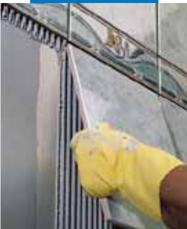
Installation of single-fired tile on wall render